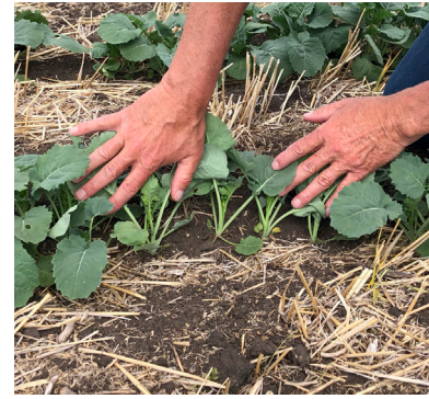
Canola treated with Pelta technology and planted with a singulation planter. Left photo taken: June 23, 2021 – Crossfield, AB. Right photo taken: May 14, 2021 – Carstairs, AB.